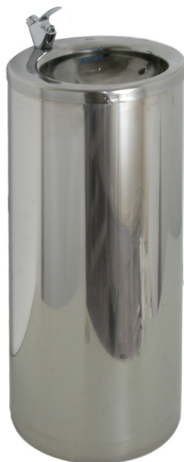
Public tab 1700 column stainless steel