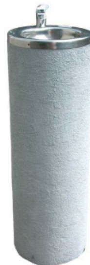
Public tab 1710 column texture