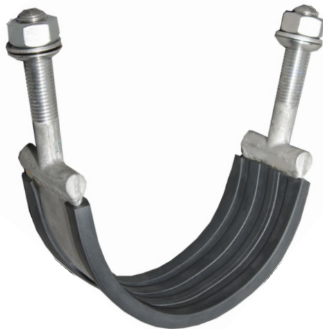
Pipe strap DN100