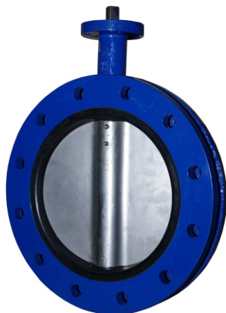
Butterfly valve DN250