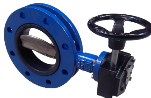
Butterfly valve DN150