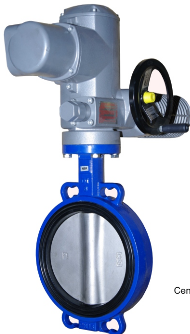
Centric butterfly valve DN200