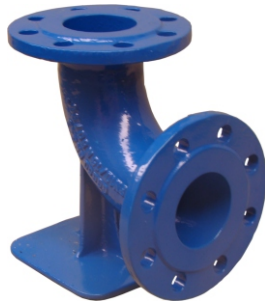
Cast iron elbow N 9202