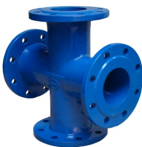
Flanged cross type CF 9218