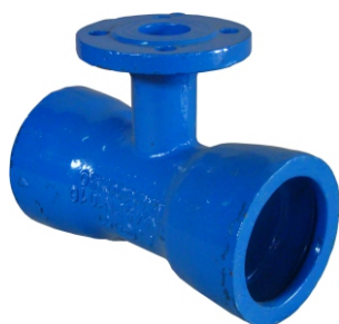
Flange and double-socket tee connector MMA 9205