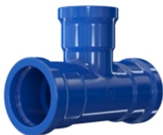
Socket tee MMB 9206