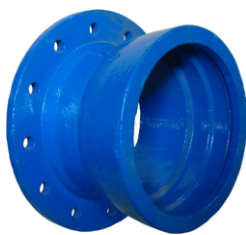
Flange and socket pieces E 9217