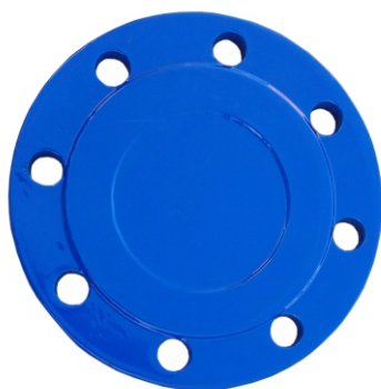
Blind flange 9219